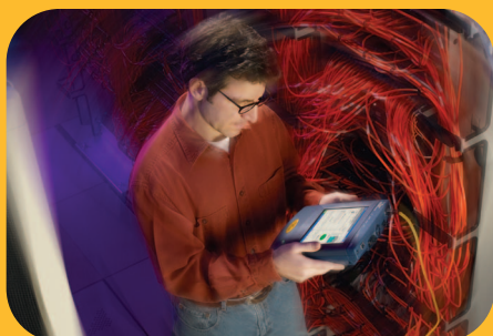
OptiView Integrated Network Analyzer

Identification of corporate requirements leads to establishing security policies that define, control and enforce the security arrangement between users and assets. These policies must address the means for identifying and authenticating trusted users and granting permission to use certain resources. They must also define the appropriate use of resources and establish mechanisms for enforcing and remedying violations.